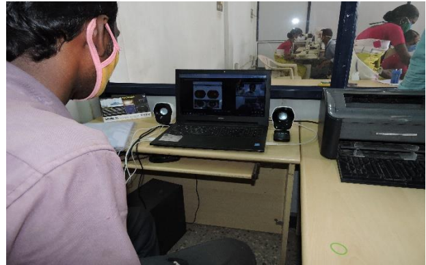
Tele - Ophthalmology